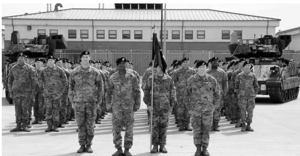
B-2/7 In following Company Change of Command ceremony at Camp Humphreys, Korea