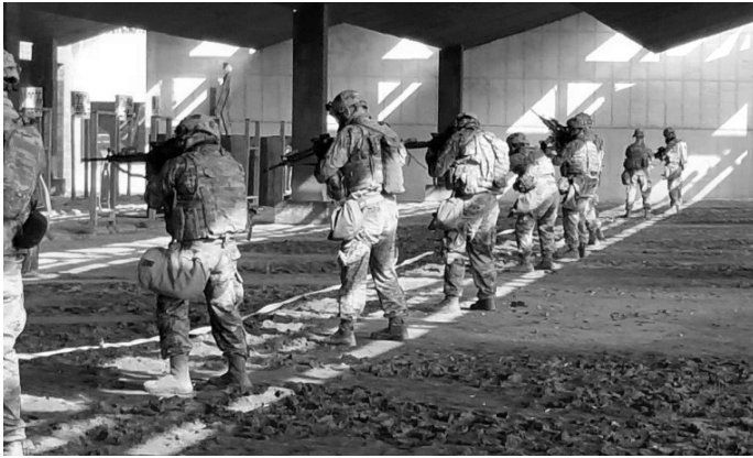
A-2/7 IN short range marksmanship training