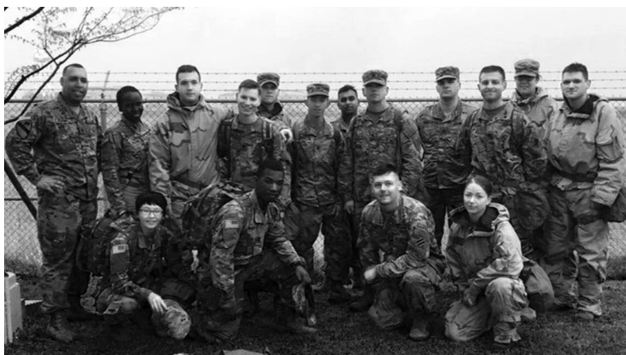
The Medical Platoon poses for a picture after the Gas Chamber during the Battalion CBRN Academy

SP4, DCO & HHC 3-7 (1987-89) 3596 Squires Woods Way Lexington, Kentucky 40515 Tstansellk9@yahoo.com