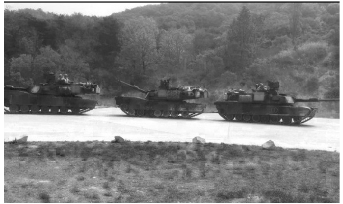
C-2/7 IN conducting towing with a brake tank