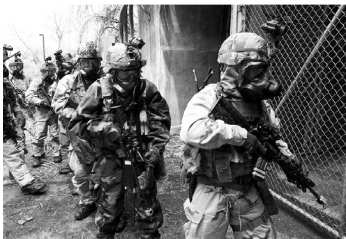
A-2/7 In squad preparing to breach an objective