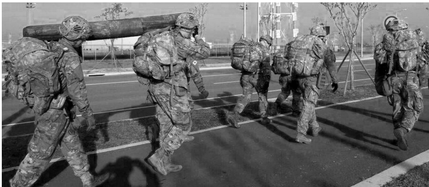
Members of B-2/7 IN carry an 80 pound log during a tactical foot march.

Chaos Company is making the most of its new home and is hitting the ground running! As promised, the land at our new home is much friendlier to running our tanks. The Soldiers and Leaders of 3-69 AR are going above and beyond in helping us get after good training opportunities to include navigating a minefield, crossing a river, or hiding 70 tons of shock and awe. The training is demanding and as the