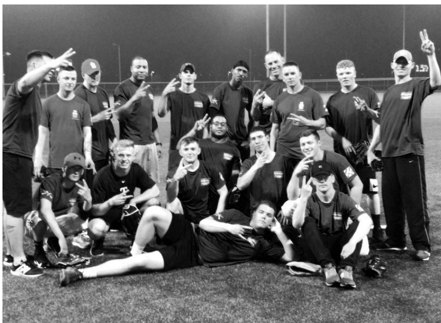
Cottonbaler softball team - post game

This is Bushmaster 6 relaying a message from the all of the Soldiers to their families: We love you guys! We miss you all!