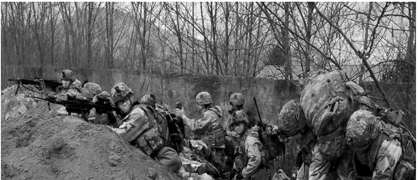
Members of B-2/7 IN provide security as the aid and litter team performs medical transportation during Company Air Assault