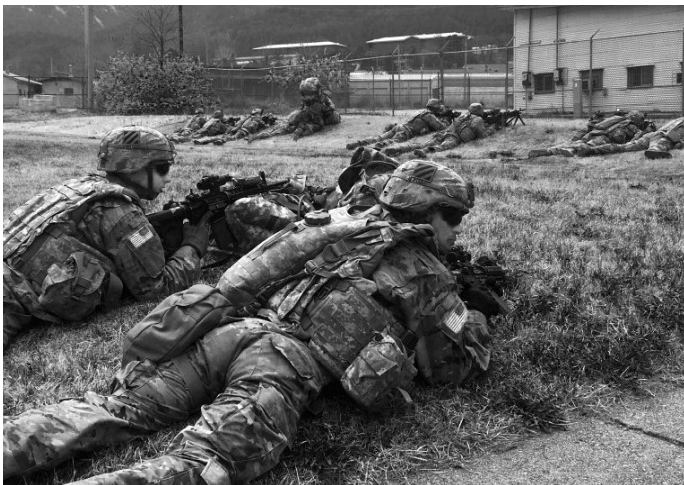
Members of B-2/7 IN provide security during company air assault training.