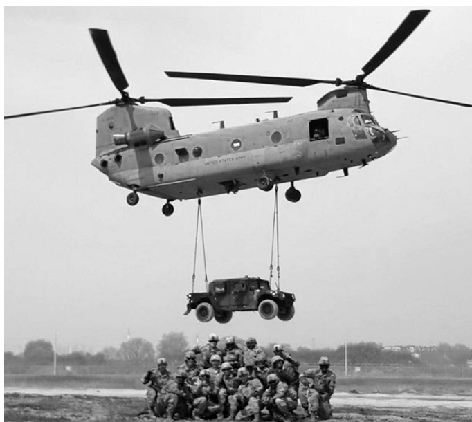
HHC conducts sling load operations of a M1165A1 HMMWV with a CH-47 helicopter.

After the initial chaos of arrival, setting systems in place, and getting settled into a new location, 2-7 Soldiers are beginning to explore some of the cultural wealth of Korea. Recently, 160 Cottonbalers took time for an R&R trip to the Coex Mall in Seoul. The Coex Mall is the world's largest underground mall and boasts a Guinness Book of World Record holding cinema complex, a unique public library, and the nation's largest aquarium. The mall is also host