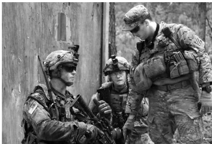
Coldsteel 6, 3-7 INF, mentors a 48th IBCT Soldier.