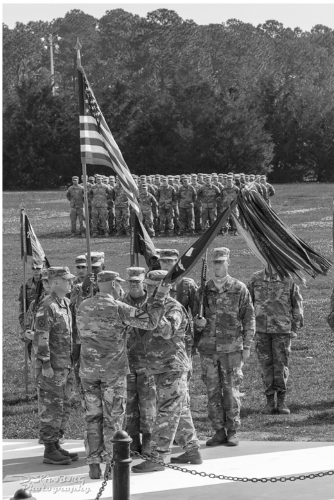
Reunion members and friends attended the Change of Command Ceremony for 2-7 Infantry Battalion

The Association's Board of Directors recommended