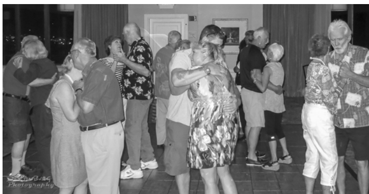
Dancing at the Reunion Banquet Dinner