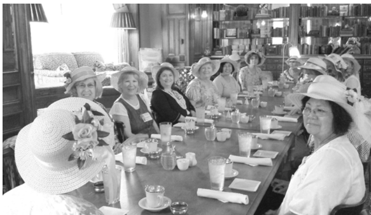
Cottonbaler Ladies Tea in the Gryphon Tearoom, Savannah, GA