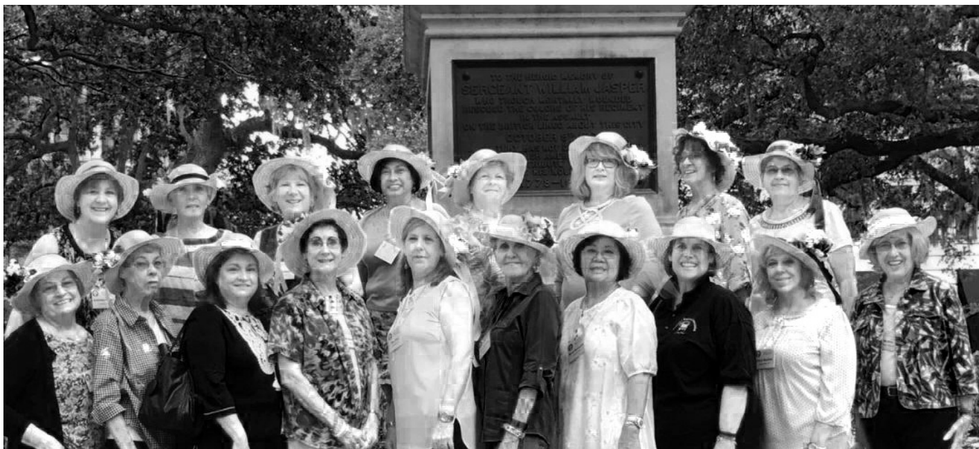
The Cottonbaler Ladies with their hats in Madison Square, Savannah, GA