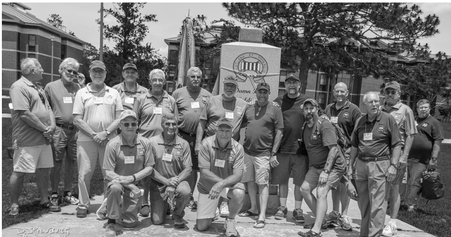
Cottonbalers who served in 3-7 IN during various time periods gather in front of the Cottonbaler Monument

The Task Force is preparing to conduct several missions over the next three months, including extensive gunnery, team and squad live fire exercises, garrison inspections and preparation for a National Training Center rotation in October at Ft. Irwin, California. This unique training event will further prepare us for our upcoming deployment to the Korean Peninsula in February of next year. I would like to take this opportunity to express my gratitude for the opportunity to lead such a proud and accomplished battalion. These Soldiers have continued to demonstrate the fighting spirit and unfailing dedication to duty and to country that has served this regiment well from its beginnings during the War of 1812 right up to the present day. I look forward to serving the proud men and women of this unit to the best of my