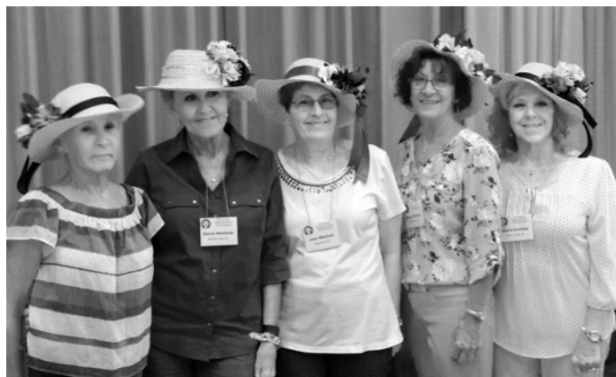
Some of the Cottonbaler Ladies showing off their hats