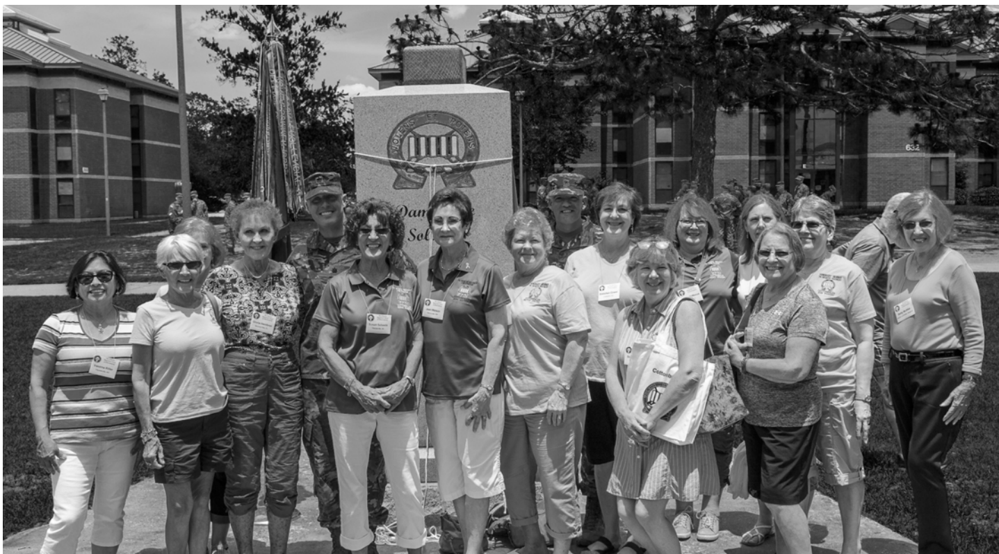
Cottonbaler Ladies at the Cottonbaler Monument