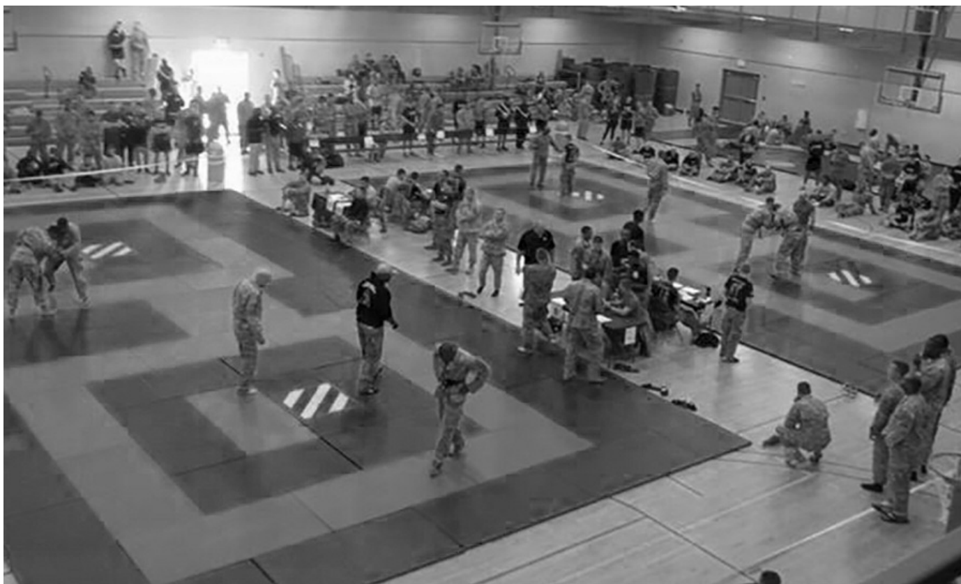
3/7 IN: Marne Week Combatives Competition

Please visit and "like" the 3-7 Infantry Battalion Facebook page by searching "3-7 IN BN Cottonbalers" on Facebook. ♦