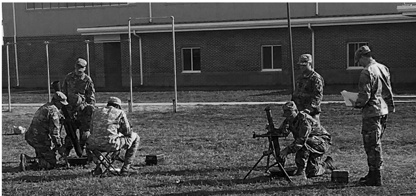
3/7 IN conducting mortar exams