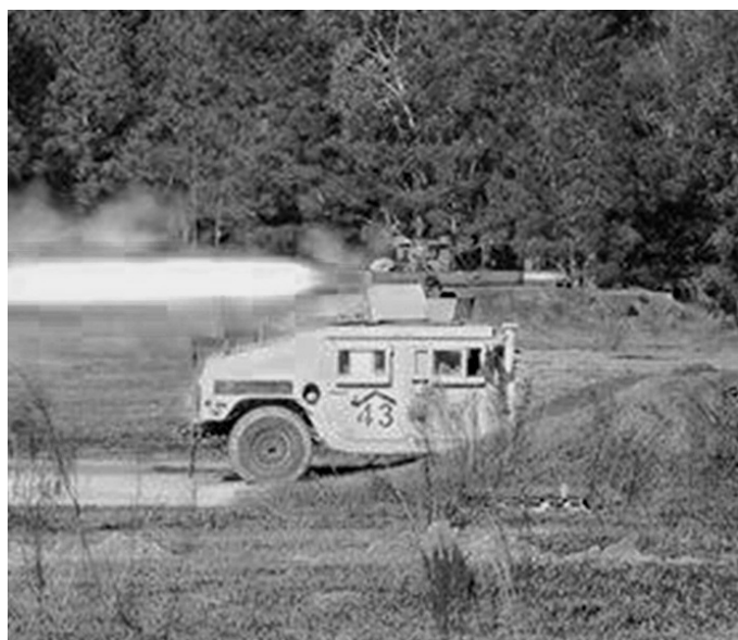
3-7 IN conducting a TOW missile live fire