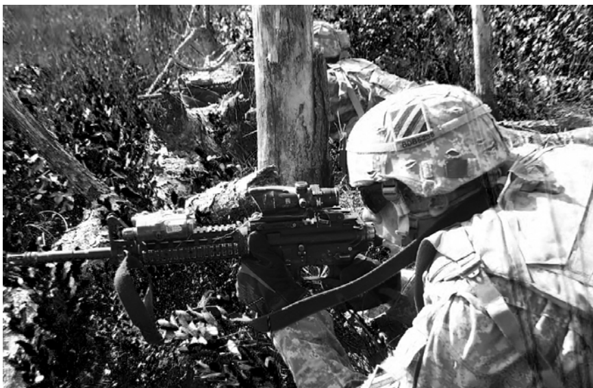
B/3-7 IN Live Fire