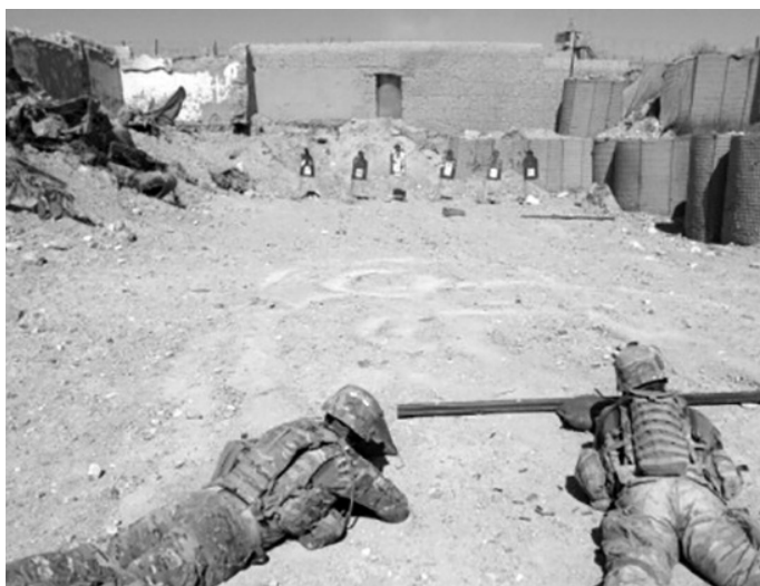
A/3-7 2nd PLT soldiers execute a small arms range to maintain marksmanship proficiency. 2nd Platoon built the range as part of their camp improvement.