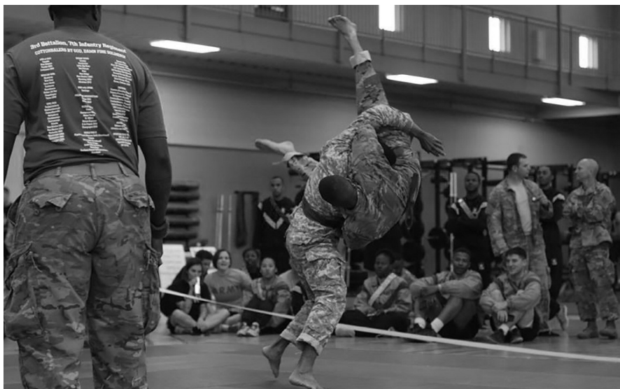
3-7 IN participating in the Marne Week combatives event

The past quarter was yet another busy one for the Assassin Family. The majority of our time was spent in the field conducting multiple live fire exercises, qualifications, and gunnery. This was all in preparation for A/2-7 IN's assumption of the Immediate Response Company Mil-